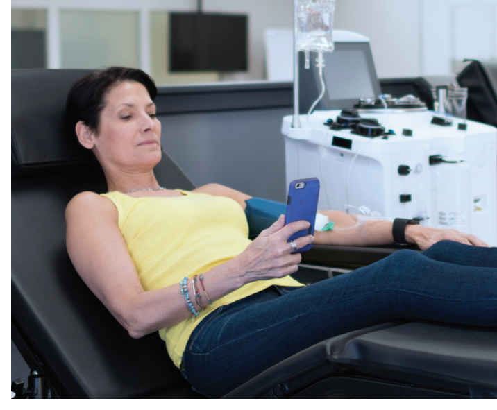
Collect more plasma with consistent, efficient operations that help drive donor satisfaction and keep them coming in to donate

NexLynk DMS can help you ensure you're serving your donors as well as possible, every time. You can also pair NexLynk DMS with Donor360™ software solutions to enable donor self service and enhance donor engagement beyond the plasma center.